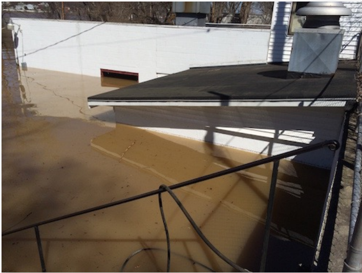
Council 1764 In Ludlow KY flooded again this spring.